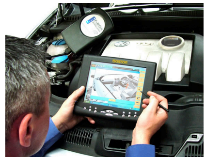
A technician using manufacturer specific diagnostic tools which will be able to be purchased by independent businesses under this new legislation.

It also covers all industries, so in the long term consumers will have the freedom to choose on repair work on all products. We look forward to a level playing ground which has been sadly missed by the motoring industry in Australia.